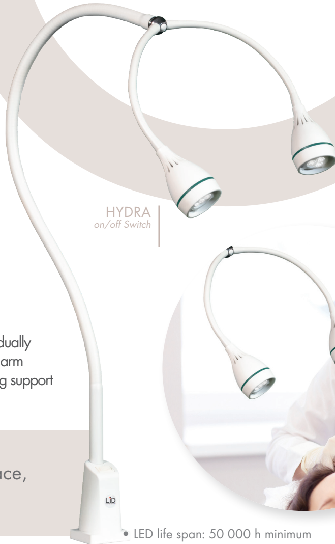
HYDRA on/off Switch

Ideal in cosmetic surgery and beauty care for treating the face, scalp, for mesotherapy, hair implants, tattooing, etc.